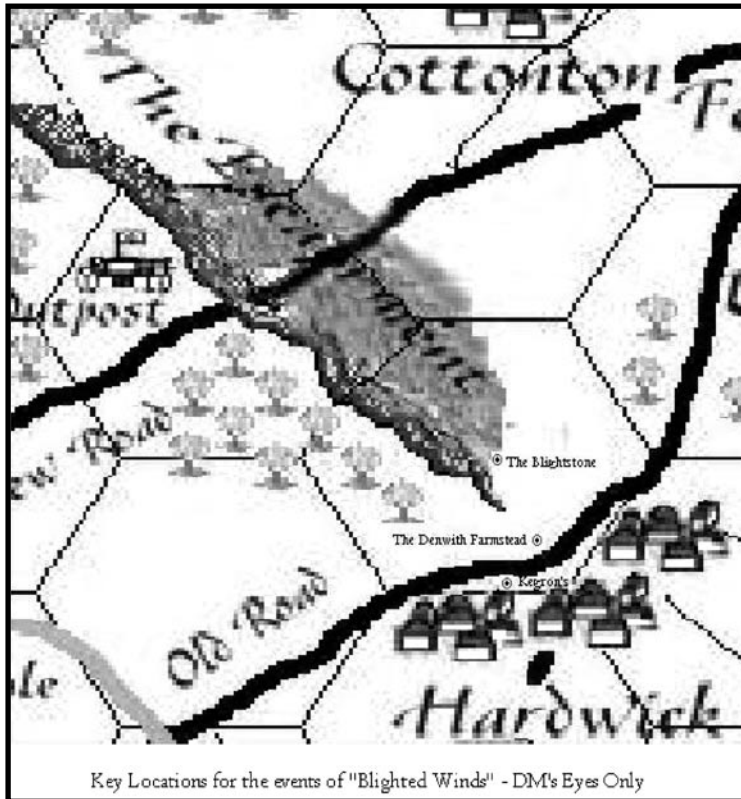
Key Locations for the events of "Blighted Winds" - DM's Eyes Only

As long as the PCs do not commit murder and as long as they behave themselves, move to the next text section. If they have killed Ivel or Gunnar, the adventure is essentially over, as they must now flee the scene before Hardwick's guards arrive. If this occurs, adjudicate that mess as you see fit.